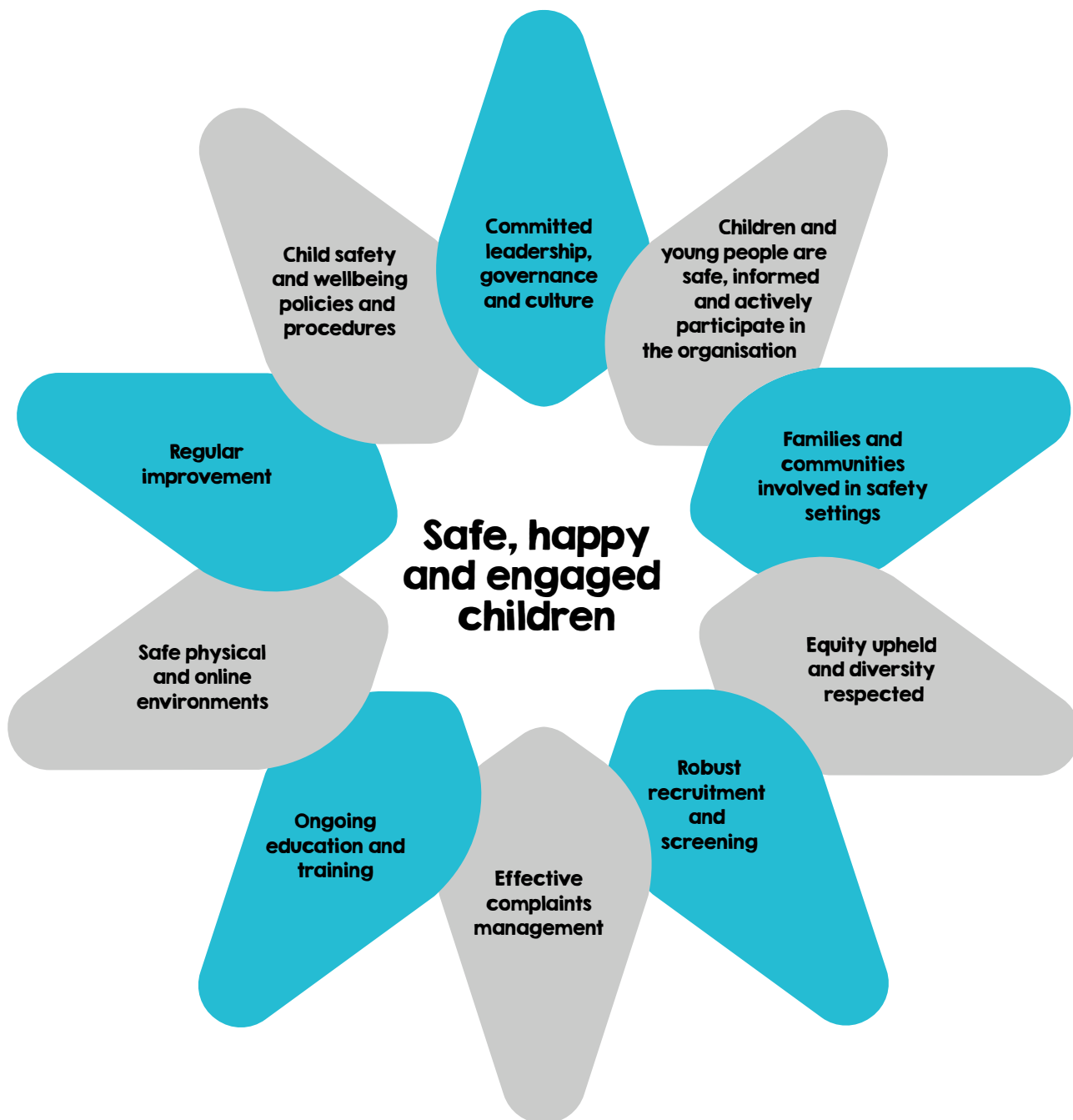
Wheel of Child Safety